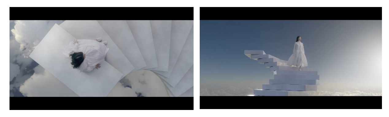
She gets up gently and goes down the stairs with light steps. And she begins talking to us.