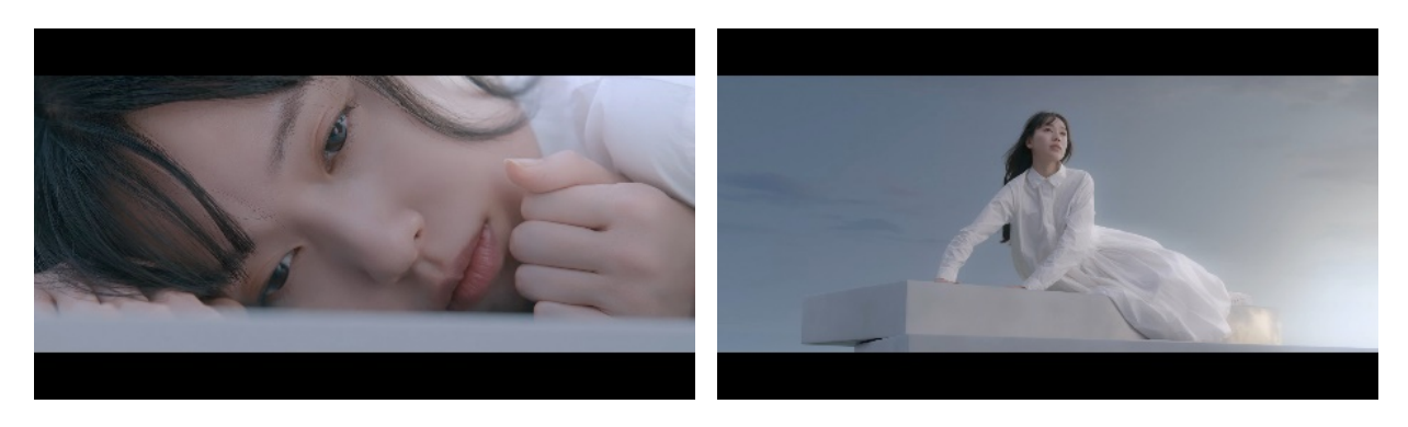
Erika Toda wakes up to the sound of the wind. She is on the top of a spiral staircase in the sky.