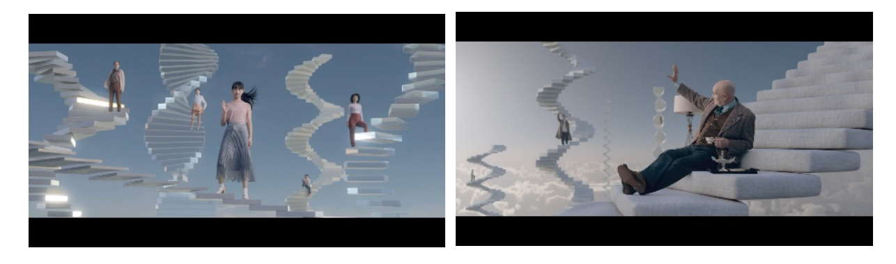
As she looks around, she finds people who are on their own spiral staircases of different materials and features. She sees people waving to her, a child hopping, someone dancing, and a person drinking tea in a relaxed mood.